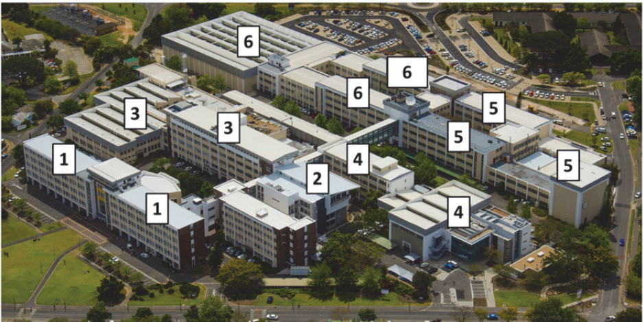
Figure 1.1: The building complex of the Faculty of Engineering (the numbers are used in the descriptions below).

The current building complex in Banghoek Road, Stellenbosch, was completed in the seventies and since then it has been expanded from time to time; for example, when the Knowledge Centre was added in 2012. The figure below shows an aerial photograph of the current complex.